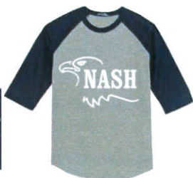
Baseball 3/4 Tee