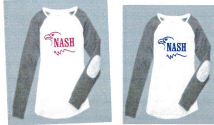
Girls Long Sleeve T