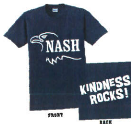
Kindness Rocks T-Shirt