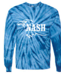
Tye Dye Shirt